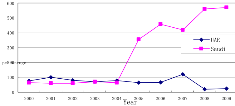
Figure 2: Ratio of FOREX to Foreign Debt

Figure 3 is the ratio of the FOREX and M3. The ratio was about 10% -20% from 2000 to 2003, basically inclining to the critical point. While after 2004 this indicator exceeded 100%, showing good establishment conditions. Therefore, Saudi's foreign exchange reserves, external debt, and the M3 indicators were fully fit to establish SWFs after 2004 based on existing studies on the establishment of SWFs theory.