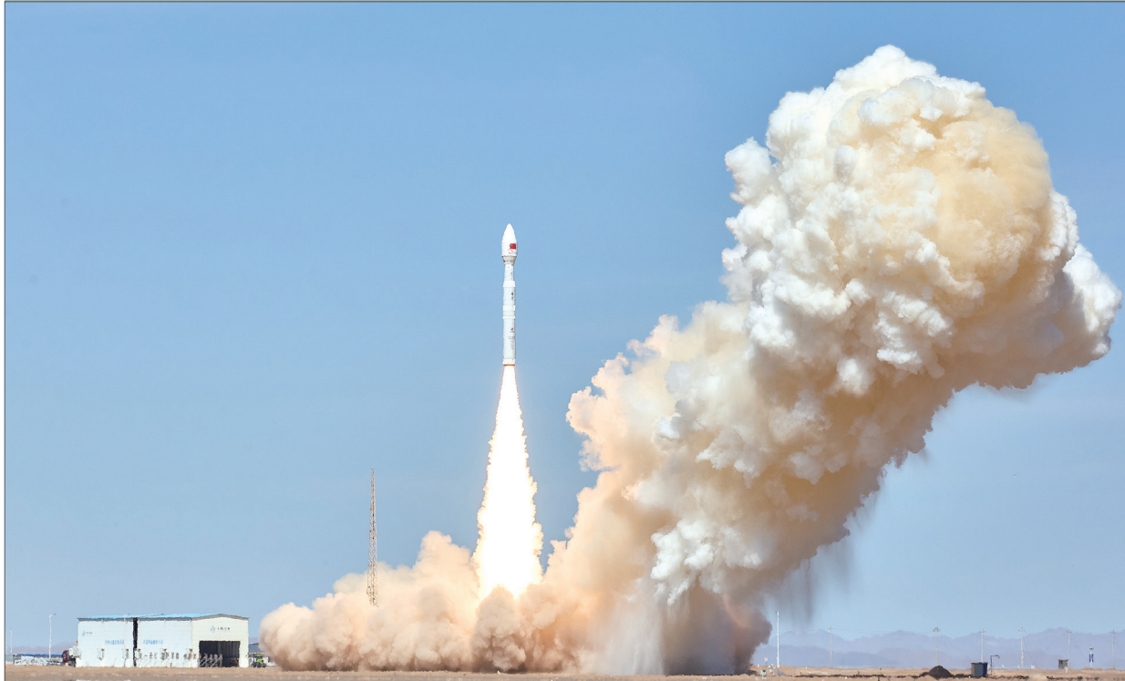
The Kinetica-1 Y12 carrier rocket carrying 8 satellites takes off from the Dongfeng commercial space innovation pilot zone in Northwest China on April 14, 2026 (See story on Page 4).