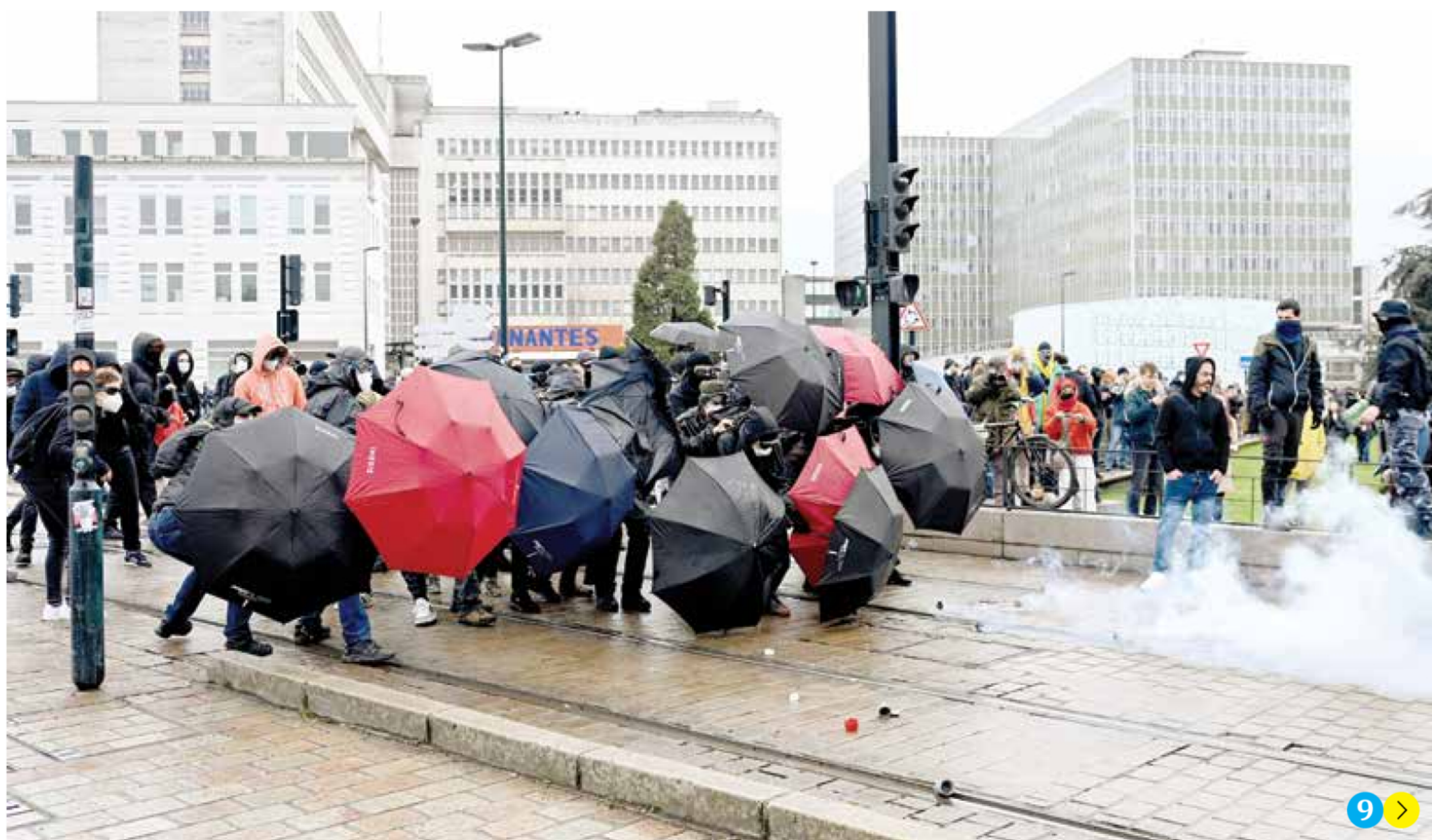
Protesters shield themselves with umbrellas during clashes with police on the sidelines of a demonstration as part of a nationwide day of strikes and protests called by unions over the proposed pensions overhaul in Nantes, western France, on March 11, 2023. 9 > ● SEBASTIEN SALOM-GOMIS/AFP