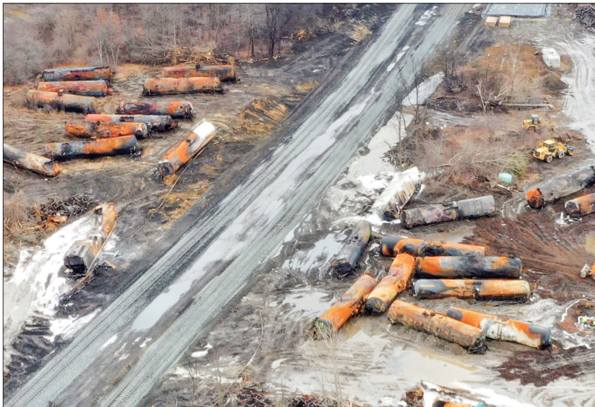
This photo taken on February 9, 2023 with a drone shows the site of a Norfolk Southern freight train carrying toxic chemicals that derailed on February 3, 2023 in East Palestine, Ohio.