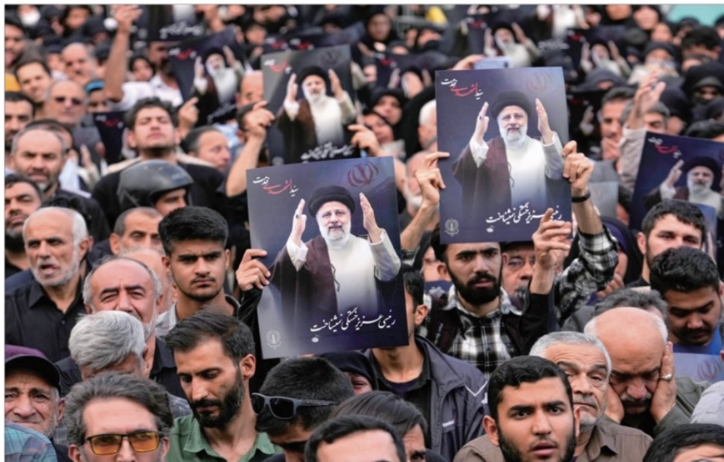
People hold up posters of President Ebrahim Raisi during a mourning ceremony for him at Vali-e-Asr square in downtown Tehran on May 20, 2024.