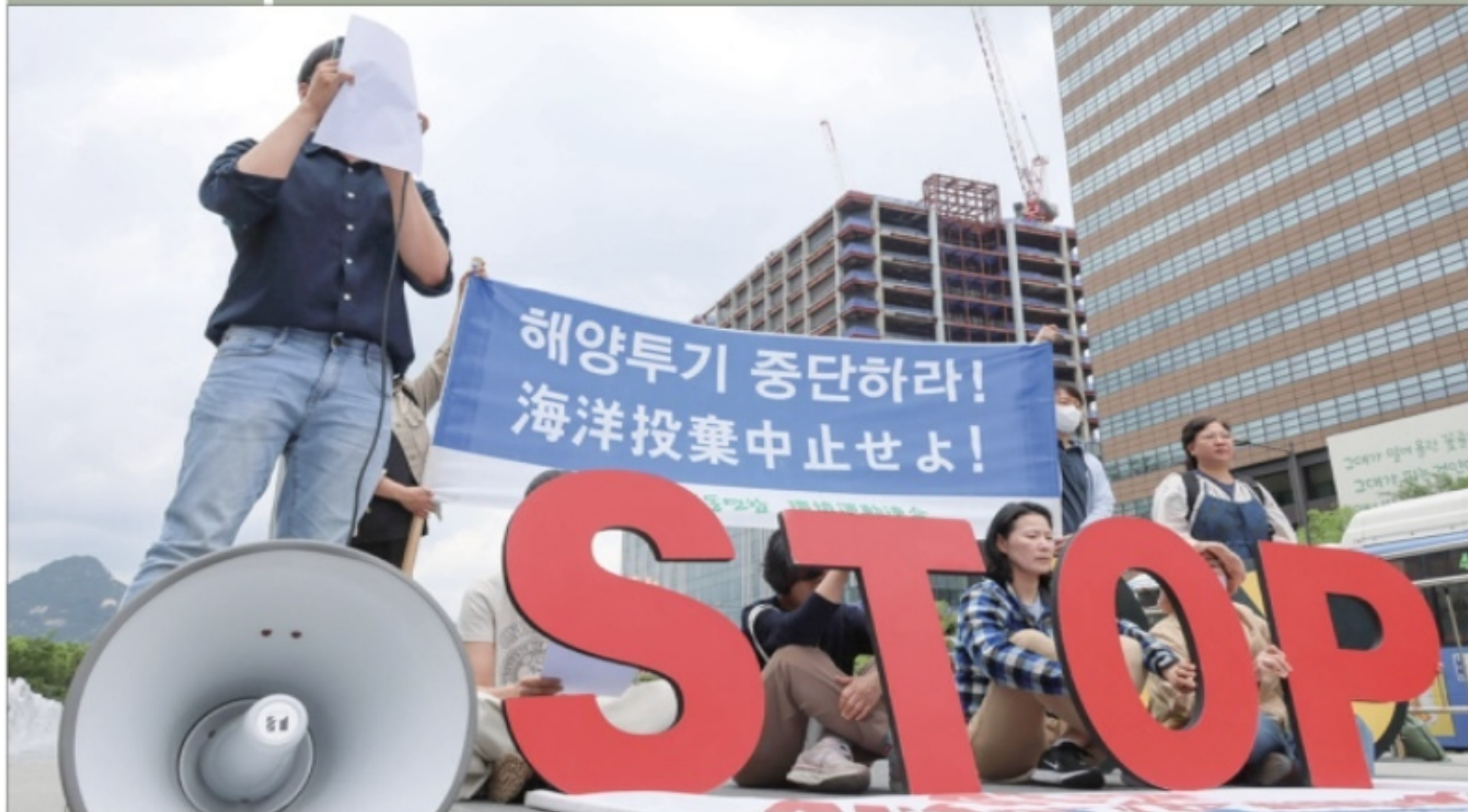
South Koreans in Seoul gather on May 20, 2024 to protest against Japan after the Japanese government recently started the sixth round of release of nuclear-contaminated wastewater from the crippled Fukushima Daiichi Nuclear Power Plant into the Pacific Ocean.