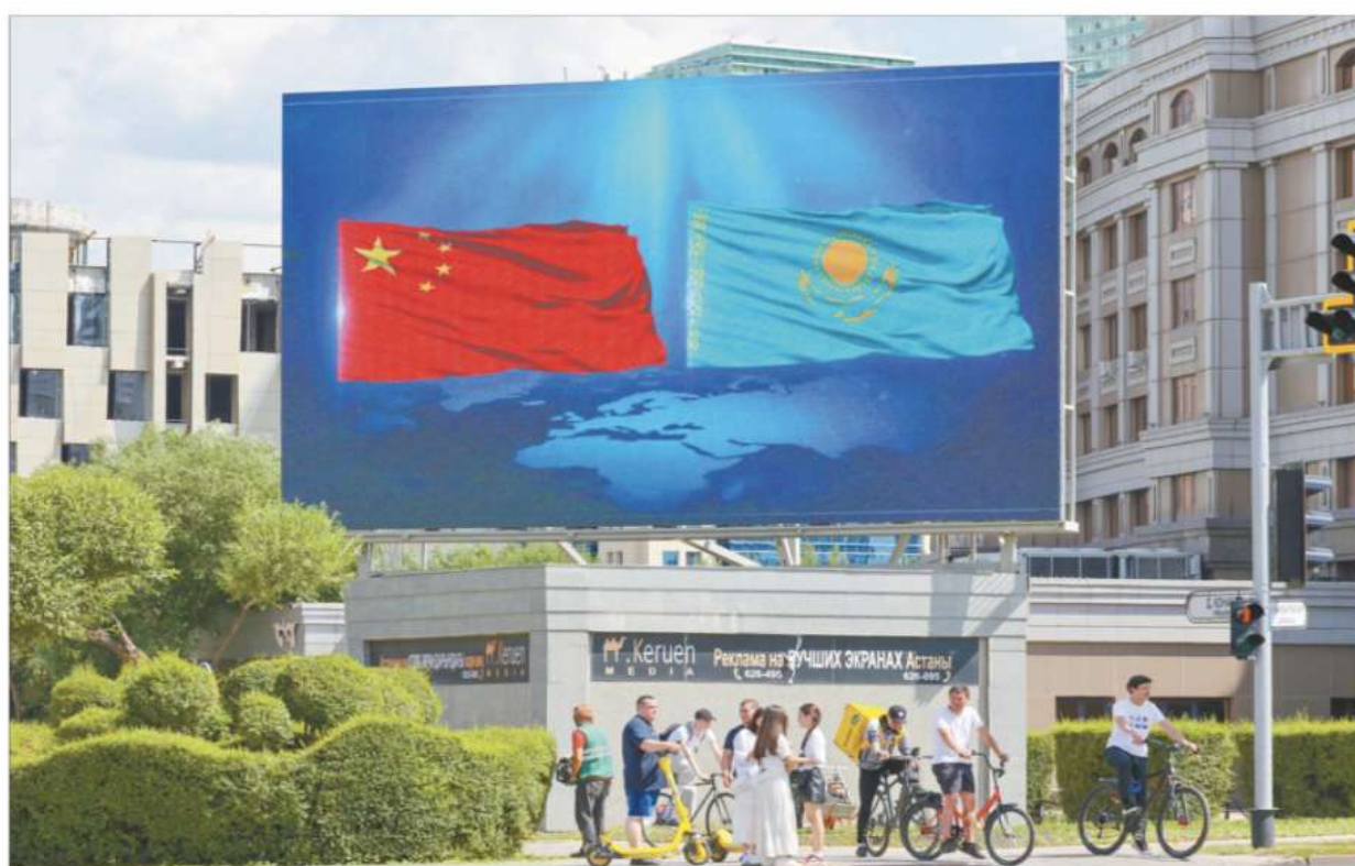
An outdoor screen shows the national flags of China and Kazakhstan in Astana, capital of Kazakhstan on June 15, 2025.